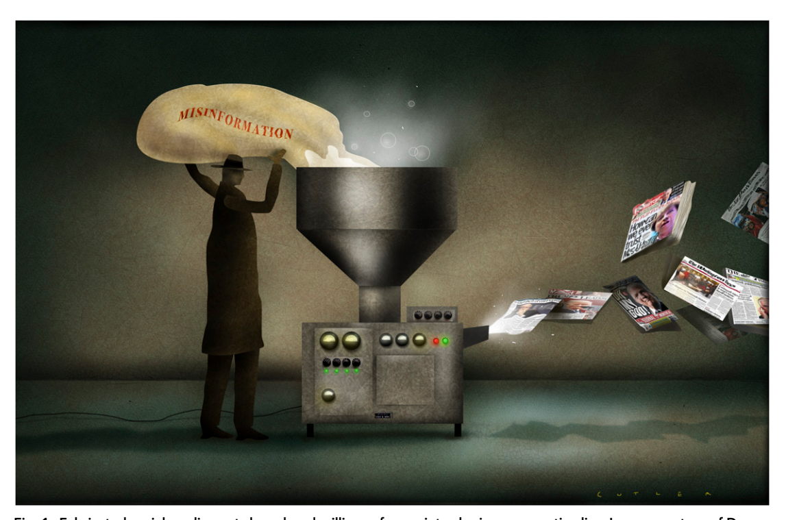
Fig. 1. Fabricated social media posts have lured millions of users into sharing provocative lies. Image courtesy of Dave Cutler (artist).

Social media users were also being targeted by Russian dysinformatyea: phony stories and advertisements