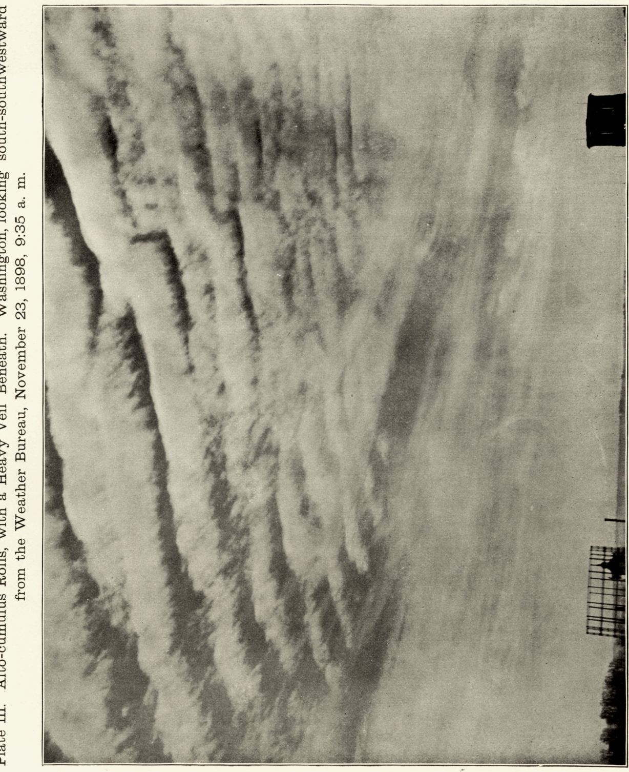
Plate III. Alto-cumulus Rolls, with a Heavy Veil Beneath. Washington, looking south-southwestward