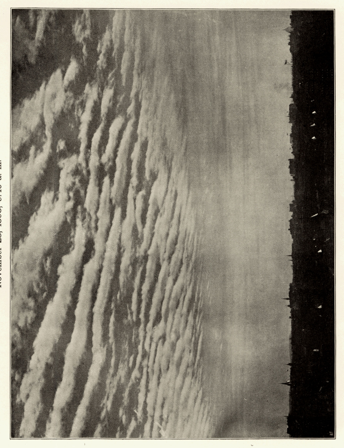
Plate IV. Alto-cumulus Rolls, Dissipating. Washington, looking eastward from the Weather Bureau, November 23, 1898, 9:40 a.m.