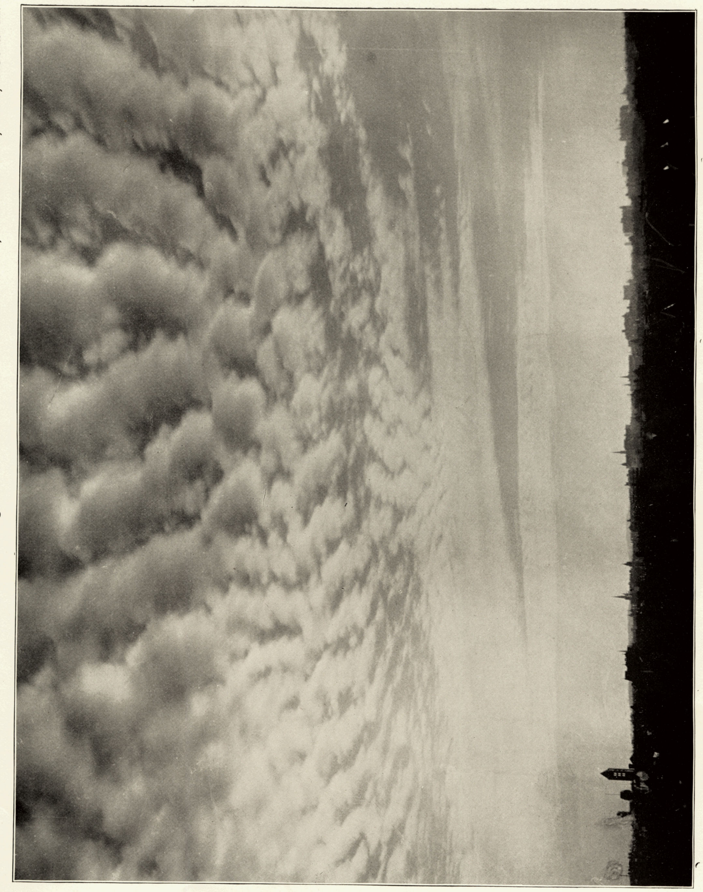
Plate II. Alto-cumulus Rolls. Washington, looking eastward from the Weather Bureau, November 23, 1898, 8:30 a. m.