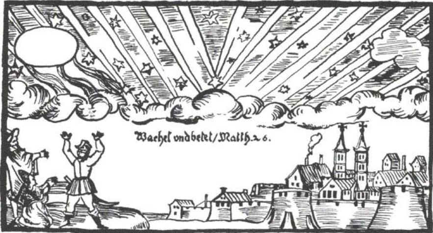
Fig. 11. A display of northern lights at Rothenburg, Germany. The oval form at the left suggests that this picture may refer to a saucer similar to that of 1882. The Biblical inscription says "Watch and pray" (Matthew 26:41).

The association with the passage of a meteor suggests one additional way that the great 1882 saucer may have occurred. When a meteor, even a small sand grain, passes through a layer of the upper air it may act like a match, to "ignite" or intensify any faint auroral glow already present. The actual process is complicated, and certainly not one of combustion. But it may very well be related to magnetohydrodynamics as previously described.