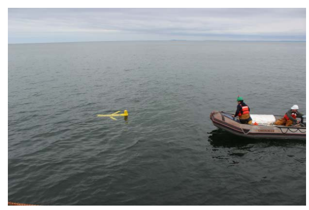
Deploying one of the two Slocum Gliders

science mission provided by the Canadian Centre for Ocean Gliders. These ocean gliders look like bright yellow torpedoes. They carry a suite of science instruments.