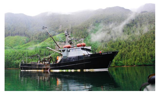
Ocean Pearl at anchor on the west coast of Haida Gwaii

Surely only a tiny fraction of the whales that are here are being seen from the ship. Frequently the whales swim to within a few meters of the ship as if they wonder who is so noisily engaged on their ocean pasture. As the ship returned to shore it found great whales again in similar numbers in a natural plankton bloom in the shallow near shore waters of Queen Charlotte Sound.