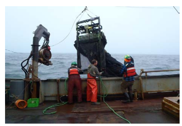
MOCNESS multiple net plankton collection device

Next come the nets to capture and facilitate the study of everything from the tiniest microscopic phytoplankton to the larger zooplankton and micro-nekton (tiny fish). The net samples the team collects, records, and preserves will sustain work for months to come to unravel the mysteries of the life that is now flourishing in the bloom. The Queen of the nets is the MOCNESS, a seven net monster which is towed by the ship. It carries, like barnacles on its back, a fleet of ocean instruments.