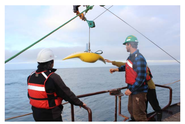
Botwing multi-frequency biomass sonar being deployed separated from the MOCNESS for a transect of the bloom

For the first time ever, 'Nessy' carries a highly sophisticated multi-frequency biomass sonar that records 3D sonar movies of the incredible scene below the waves and the plankton as they are captured in the nets. Positioned from masthead to keel are additional instruments that continuously measure ocean and atmospheric characteristics including logging the content of gases such as Oxygen and CO2.