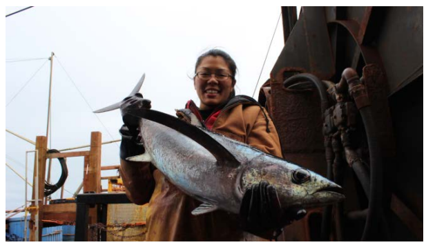
Albacore tuna arrived at the bloom.

Tuna have arrived at the bloom and prowl the edge, first to arrive are the "scouts" in small packs then later the "schoolies" arrive in large schools. They make feeding forays in the bloom; filling their stomachs full of plankton and tiny fish.