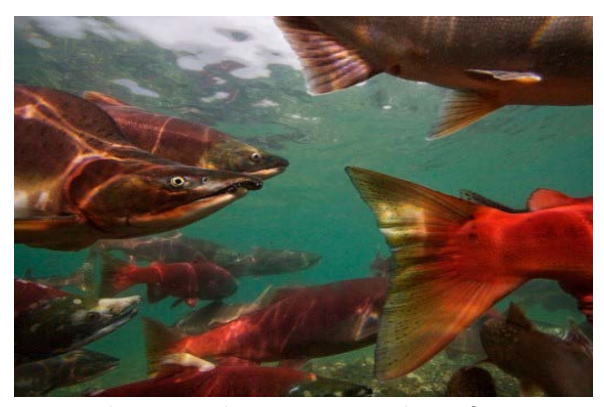
Volcano miracle Fraser River Sockeye of 2010

It is well known that dust in the wind powers ocean primary productivity by delivering vital mineral micronutrients. Mineral nutrients, i.e. dirt, are common on land but are the rarest of elements in the ocean.